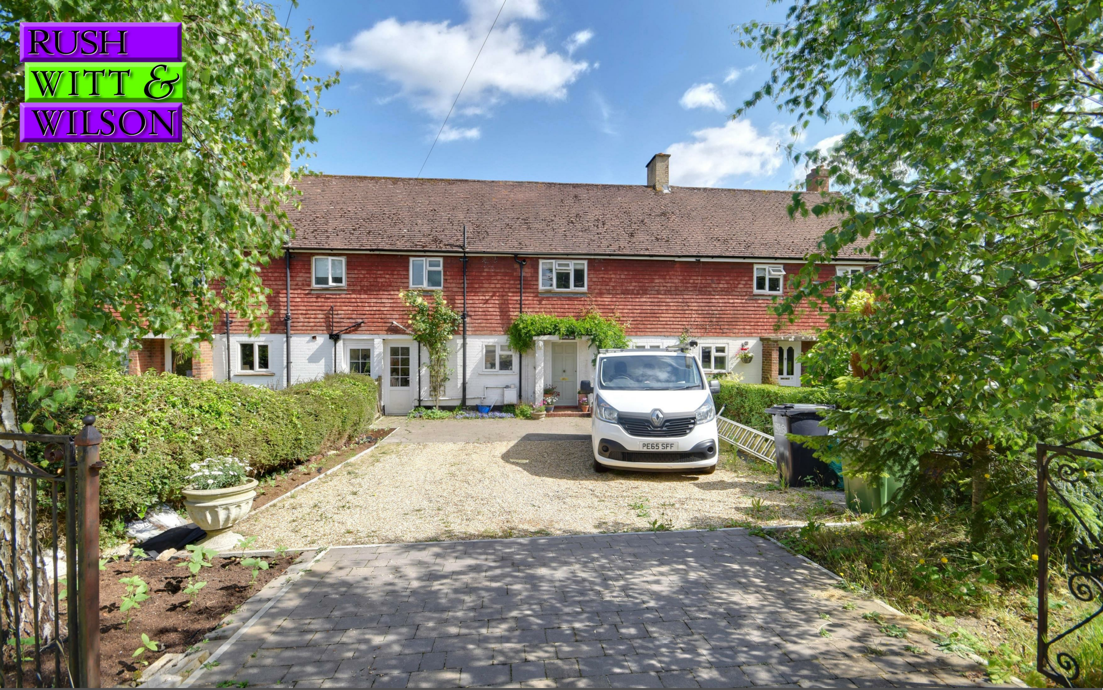
10 Coplands Rise, Northiam, East Sussex, TN31 6PU. £339,950 Freehold